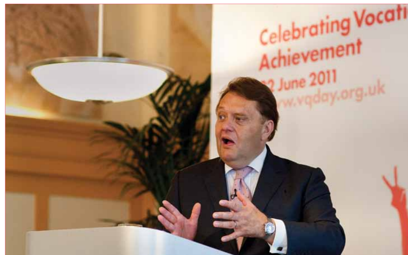
Above: John Hayes, Skills Minister advocating the importance of vocational qualifications

"We need to create a vocational pathway as robust, rigorous, progressive and as seductive as the academic courses. For too long we have assumed the only form of prowess that counts is from academic accomplishments." John Hayes MP, Conservative Liberal Democrat coalition, Minister of State for Further Education, Skills and Lifelong Learning,