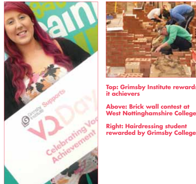
Top: Grimsby Institute rewards it achievers Above: Brick wall contest at West Nottinghamshire College Right: Hairdressing student rewarded by Grimsby College