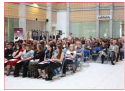
Above: York College awards ceremony Left: Carshalton College demonstrated their hair and beauty talents