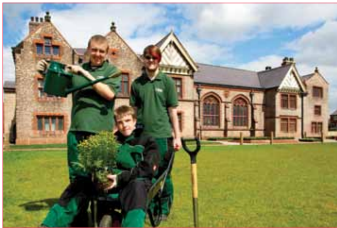
Above: Salford City College's horticulture students helped with ground maintenance at Ordsall Hall

CollegesWales led this year's celebrations at The National Museum of Wales and the Department for Employment and Learning for Northern Ireland hosted a glittering dinner event at the Parliament Buildings, Stormont.