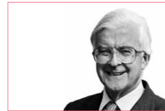
The Rt Hon Lord Baker of Dorking CH Chairman of Edge

Edge would also like to thank our partners who offered time and support to make VQ Day 2011 happen including: 157 Group, Association of Colleges (AoC), Association of Employment and Learning Providers (AELP), AAT, Award Scheme Development and Accreditation Network (ASDAN), City & Guilds, Colleges Wales, Department for Business, Innovation and Skills (BIS) Department for Employment and Learning (DELNI), Ealing, Hammersmith and West London College, EDI, the Federation of Awarding Bodies (FAB), the FE Reputation Strategy Group (FERSG), Hackney Community College, OCR, Ofqual, Ofqual Northern Ireland, Pearson, Scottish Government, Skill Smart Retail, the Welsh Assembly Government, Westminster Kingsway College and WorldSkills among others.