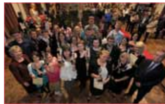
Far Right: Fashion show at Derby College