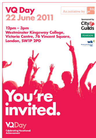
Above: Invite Educationalists, employers, MPs and colleges from across the country were invited to join in the day's celebrations

Posters and leaflets to promote VQ Day were made available for free download and to encourage people to get involved. More than 245 colleges, learning providers, schools and employers ordered posters and leaflets, leading to more than 13,000 posters and leaflets being displayed around the country.