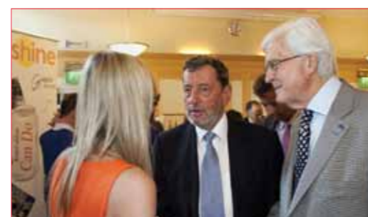
Above: David Blunkett and Lord Baker with Skills to Shine